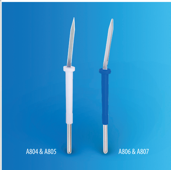
A804 &amp; A805