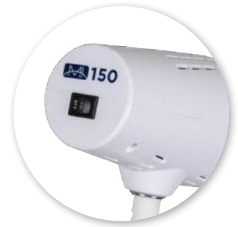
Brilliant, Color-Accurate Illumination

Visit BovieMedical.com for more information