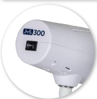
Dual Luminance Settings