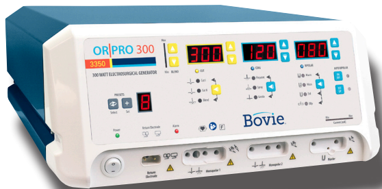
OR | PRO A3350